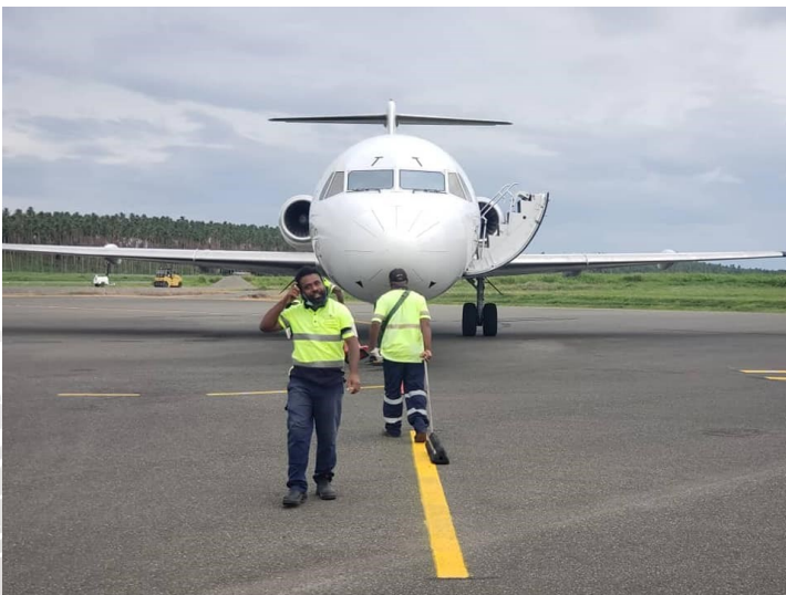
PX 204 at the recently upgraded Tokua airport, Rabaul.

Fokker jet services, operating daily flights to Rabaul with up to three flights on certain days.