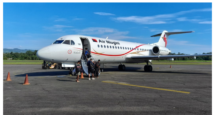
Passengers at Madang Airport boarding a Fokker 70 aircraft to Port Moresby before flights were suspended.

Dash-8 operations resumed from Monday 23rd August. We look forward to the restoration of Fokker jet services to