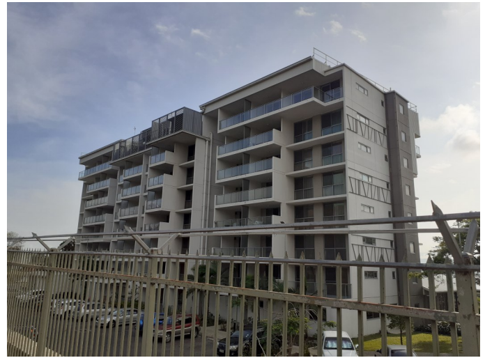
The Air Niugini residential apartment building at the Air Niugini head office at 7 Mile, Port Moresby.